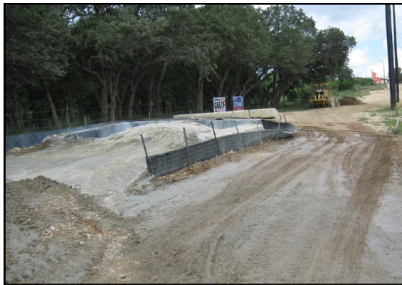
Effective Concrete Wash Out?