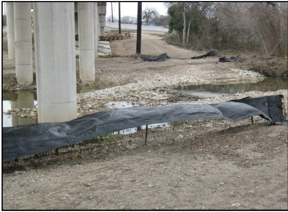
Silt fence in good condition?