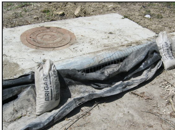
Curb inlet protection?

all registration Form to: stormwaterconstruction@sa ws.org Or mail to: San Antonio Water System